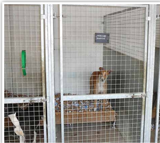
Typical single greyhound unit.

Kennels are also inspected twice every year by GBGB Stewards to ensure they are adhering to the Rules of Racing 34 .