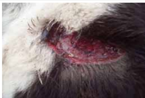
An open and infected sore on the thigh of a young dog removed from Street's property.

As trainers racing on independent tracks do not have their kennels inspected, this cruelty only came to light when members of the public complained to Wirral Council. The Council visited Street in June 2008 and issued a welfare improvement notice, which Street ignored. A further complaint was made in January 2009 and Street was visited again, but by now he was breeding puppies. The dogs were not rescued for a further three months 44 .