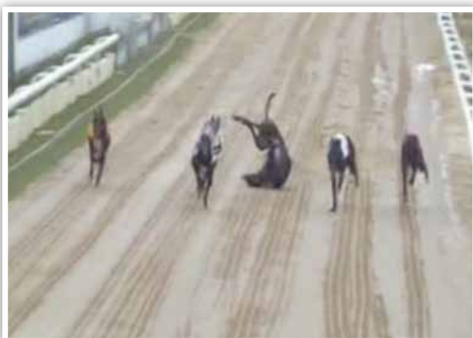
Rotar Wing's fatal fall at Sunderland, July 2011.

Without figures published by the industry, it is not possible to know the total number of dogs injured, often fatally, on British tracks every year. But this number would mask the individual suffering of each dog, many enduring excruciating fractures and premature deaths.