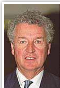
Lord Donoghue

The report also recommended that tracks be regulated through a hybrid system, with the GBGB licensing regulated tracks and local authorities enforcing regulations at independent tracks – a system that the APGAW stated would be ineffective.