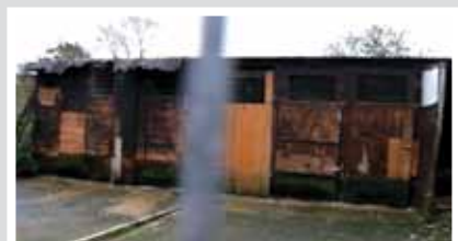
Active kennel blocks at Nigel Saunders’ property.