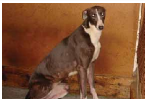
Female greyhound confined to unsafe wire kennel in almost total darkness.