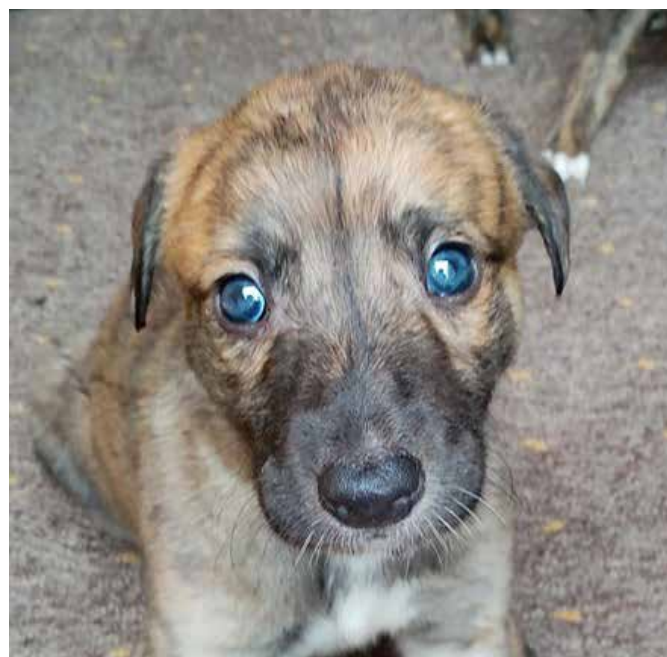
A puppy bred for racing in Ireland, 2019

On May 28, 2019, the Greyhound Racing Bill 2018 was signed into law. 19 Despite the efforts of Tommy Broughan TD and others, amendments designed to require reporting on the disposition of greyhounds and for the creation of a “white list” of acceptable foreign countries for export were defeated. 20