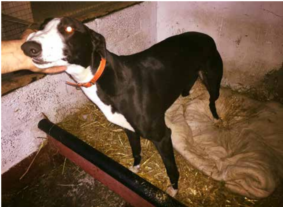
A greyhound at an Irish kennel in Donegal, 2018