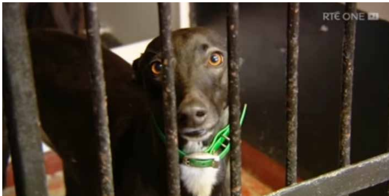
A caged greyhound in Ireland from the RTÉ exposé Greyhounds Running For Their Lives , 2019

the organisation is actually on Breeding.” Specific findings included the following: