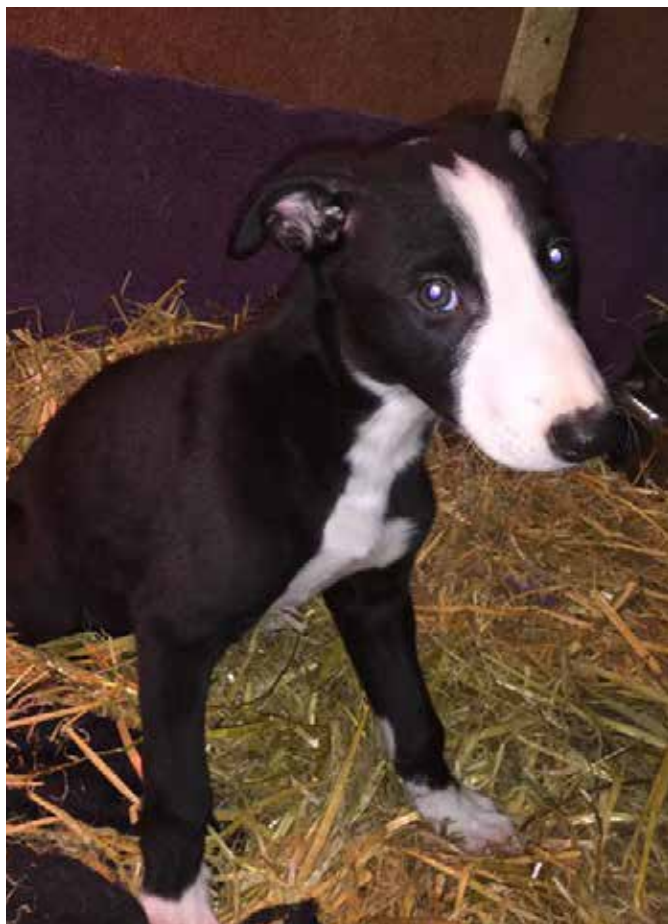
An Irish puppy bred to race, 2017