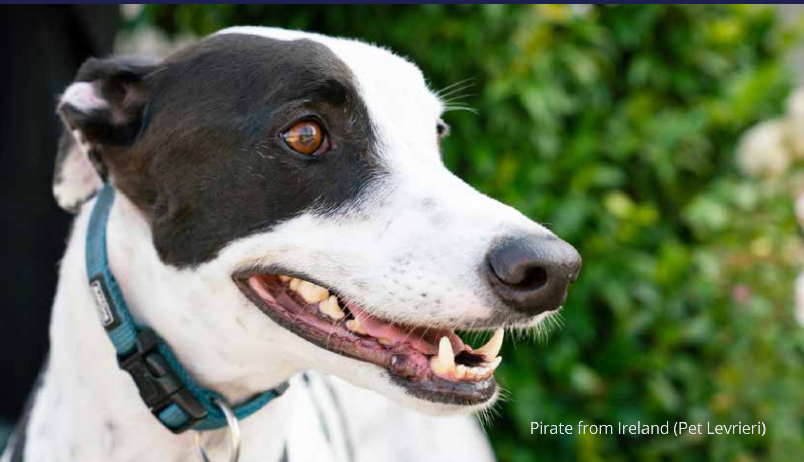
Pirate from Ireland (Pet Levrieri)