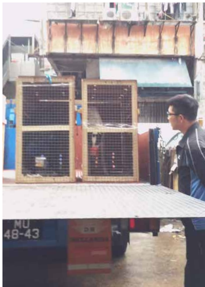
Greyhounds from Ireland arrive in Macau, China, 2016

minimal standards of the Greyhound Board of Great Britain were not maintained at tracks across the country. Common violations included kennels that were unkept and unclean, that showed thick layers of dust and cobwebs, were absent of cleaning materials and in a poor state of repair, contained sharp edges posing risk of injury, and which exposed filthy food preparation areas and other low standards. 94