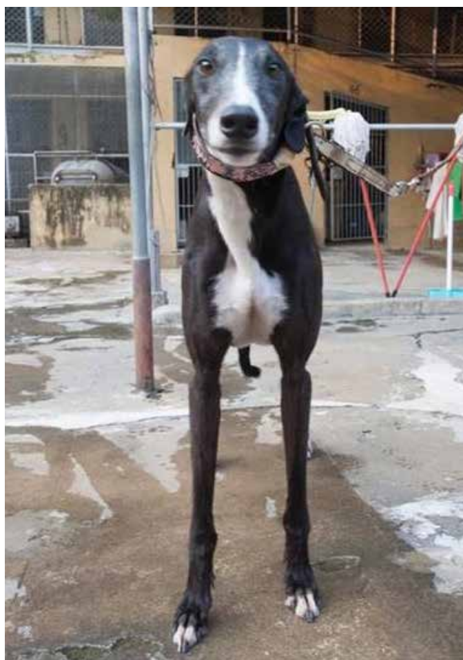
Two Stone Tadgh was exported from Ireland in 2016 to race at the notorious Canidrome in Macau, China

Regional animal welfare groups have voiced their opposition to dog racing in recent