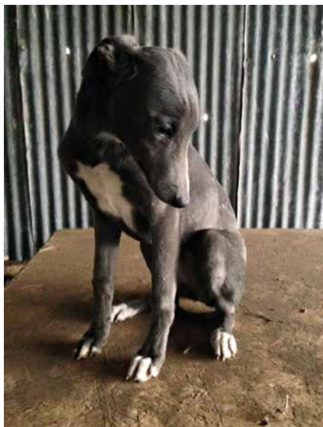
One of thousands of greyhound puppies bred at Irish kennels in 2016

On June 26, 2019, RTÉ Television ran a one-hour programme entitled: Greyhounds Running For Their Lives. The RTÉ investigation, drawing from the Preferred Results report discussed above, revealed that on average, 5,987 greyhounds were killed each year between 2013 and 2015. 108 The programme offered undercover footage and documented that half of the country’s commercial slaughterhouses inhumane killed unwanted greyhounds for fees ranging from €10 to €35 each. 109