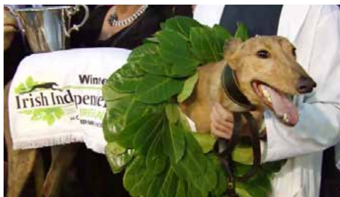
Clonbrian Hero tested positive for cocaine three times, including a positive test following his victory at the Irish Laurels final in 2017

Vice News reported that in 2017, six cocaine positives were found in four greyhounds, amphetamines were found in two greyhounds, and steroids were found in three greyhounds—one of whom tested positive five times between May and June. 28 An Irish Examiner report also drew particular attention to the cocaine positive of greyhound Tir Na Croi. 29