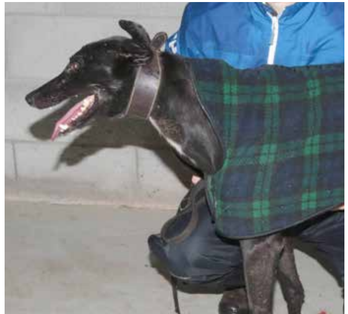
Ballymac Syd suffered a heart attack and died after racing at Shelbourne Park in August 2019