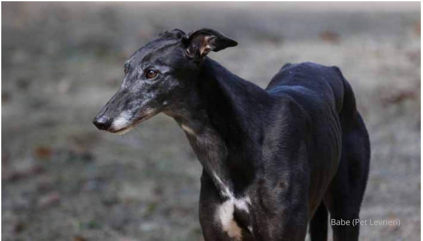
Babe (Pet Levrieri)