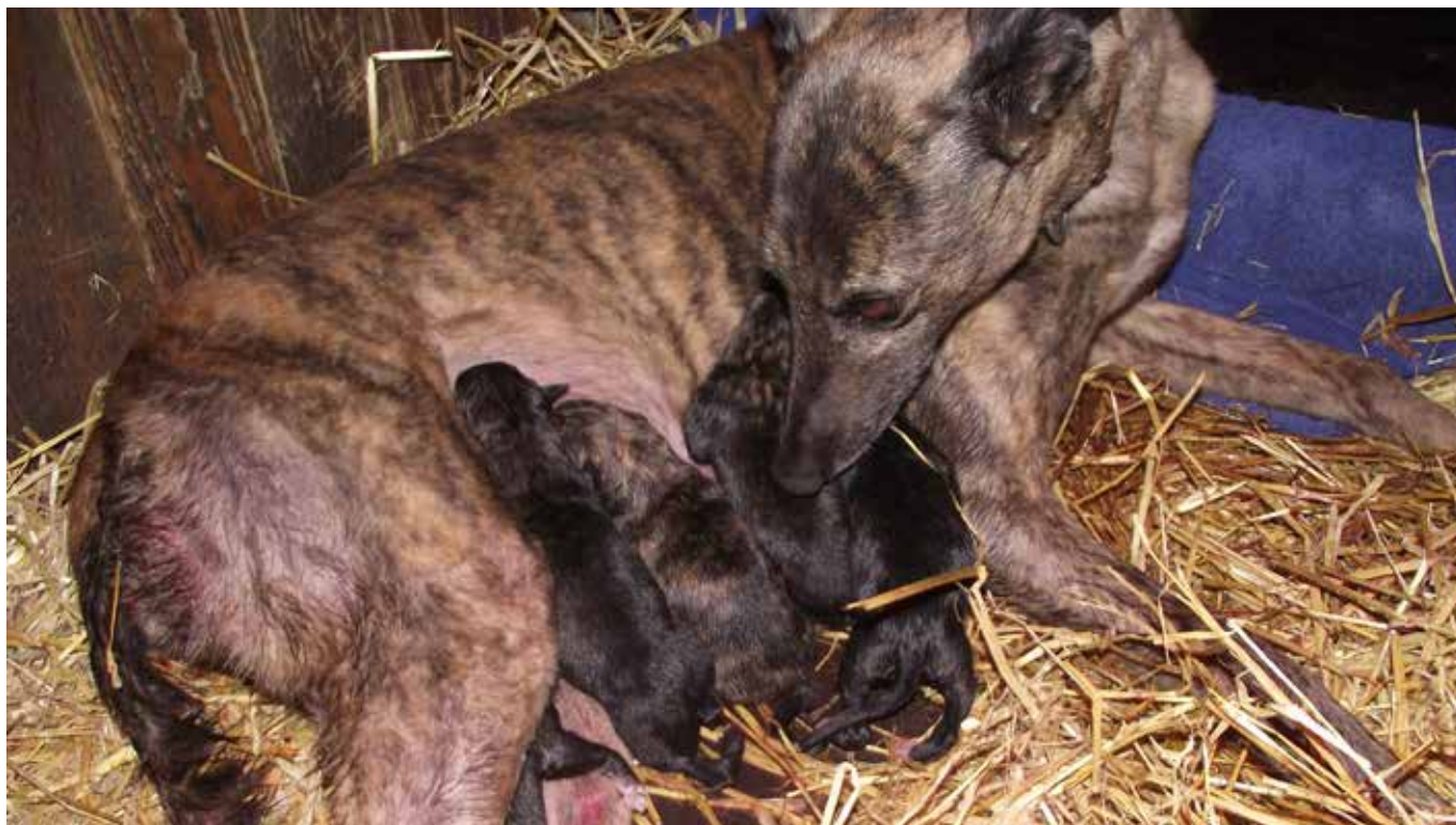
A greyhound with her puppies at a breeding kennel in Ireland, 2012

30,000 dogs of all types are bred in “back alley” facilities each year, earning for Ireland the reputation as the “puppy farm capital of Europe.” 77 Clearly, the large numbers of greyhounds produced by racing interests only adds to this problem.