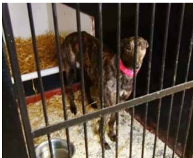
A greyhound kennel in Ireland from the RTÉ exposé Greyhounds Running For Their Lives , 2019

Thousands of Irish-bred greyhounds are housed in British kennels. The Dogs Trust's three-month investigation into kennel conditions in the UK revealed that even the