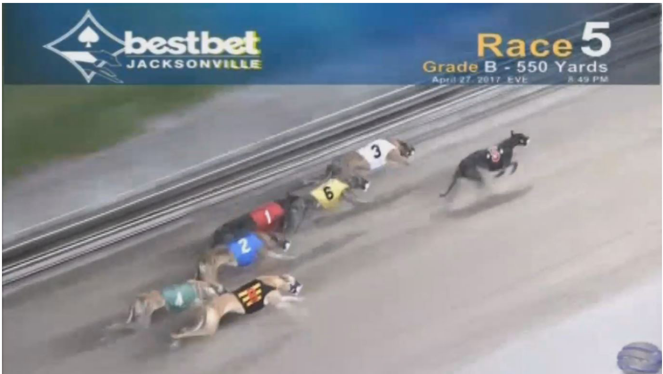
Between January 1, 2017 and May 12, 2017, WW's Flicka, shown here in the lead, tested positive for metabolites of cocaine seven times while racing at Orange Park Kennel Club. In two of these races, WW's Flicka won the race, achieving the fastest times of her career.

These drug-related rulings provide a small window into the culture of the greyhound industry. Greyhound trainers are generally prohibited from administering drugs. For example, injecting drugs with a needle is specifically prohibited, 86 yet numerous kennel inspections have uncovered unauthorized hypodermic needles, some with unnamed substances still in them. 87