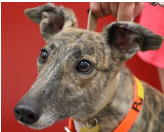
Racing greyhound Last Two Tales tested positive for an anabolic steroid in 2015 (Arizona Adopt a Greyhound, Inc.)

The biggest known discrepancy between reported drug positives and drug rulings occurs in Florida. The Division of Pari-Mutuel Wagering's annual reports from FY2008 to FY2016 cite 349 drug positives. 135 During this time, GREY2K USA Worldwide submitted monthly requests for information, but only received documentation for 124 drug positives. 136 This may be a result of laws preventing disclosure of information contained in open investigations. Therefore, barring repeated public information requests, the withheld documents never enter the public domain because regulators have no duty to inform requesters if or when a case is closed.