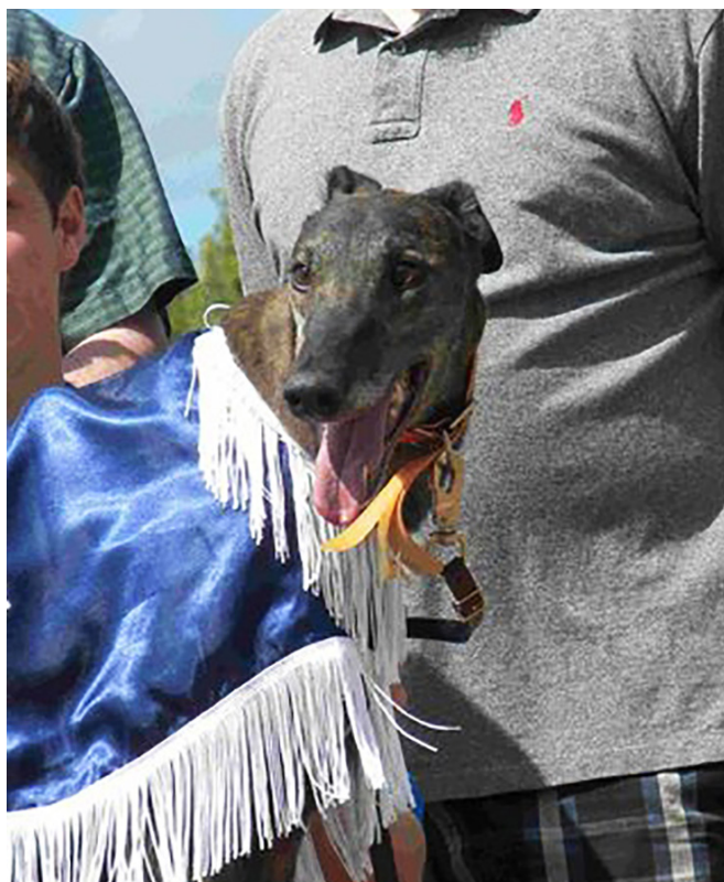
RJ's Pelee tested positive for ractopamine at Iowa Greyhound Park in 2015 (Greyhound-Data)

West Virginia, The Center for TOX Services, Inc. 25