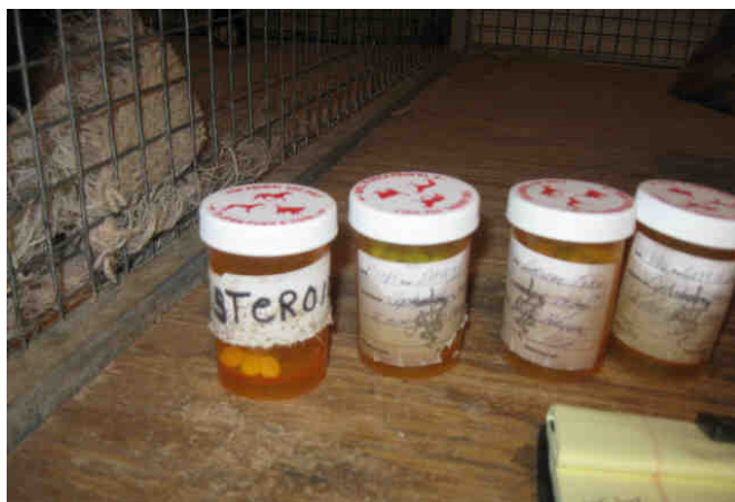
Anabolic steroids for suppressing estrus in female greyhounds at Tucson Greyhound Park in Arizona

The drug testing component of the commercial greyhound industry has made several notable changes since it was first created in the 1930s. One major change is the outsourcing of the actual testing. Though testing was originally developed internally, as in Florida’s industry, 11 every greyhound racing jurisdiction today uses an independent drug testing laboratory as a matter of course. Another change was prompted by the uneven terrain in terms of drug enforcement across racing jurisdictions. In an effort to strengthen the industry’s integrity and credibility, ARCI produced model rules, laboratory standards, and a uniform classification of all prohibited drugs. 12 Drugs were placed in a hierarchy of potential influence, from drugs with the least potential to influence race results to drugs with the most. 13 Racing