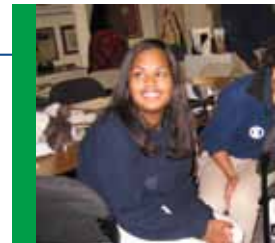
One of the Prospect Hill Academy Students