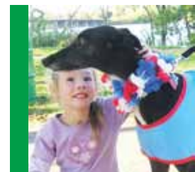
Wendy with a little girl at Riverfest in Cambridge.