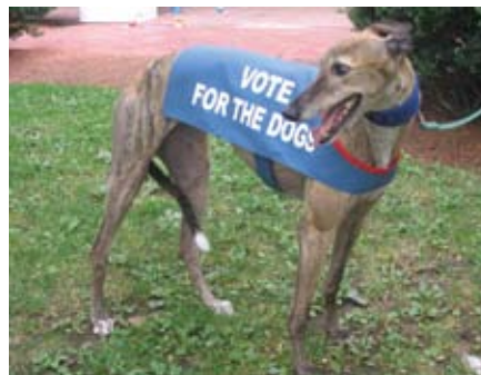
(ABOVE) Grey2k USA mascot, Gracie.