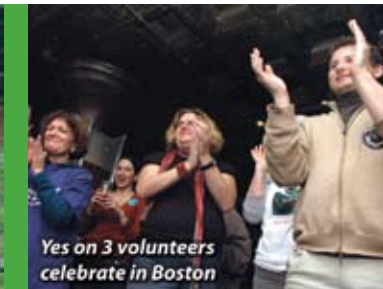
Yes on 3 volunteers celebrate in Boston