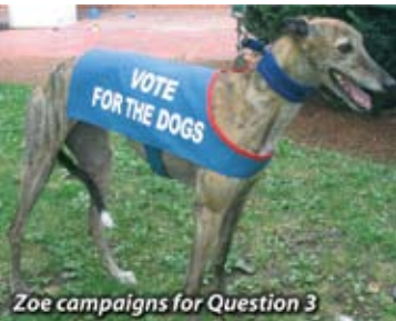
Zoe campaigns for Question 3