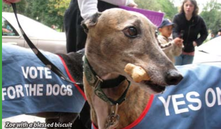
Zoe with a blessed biscuit