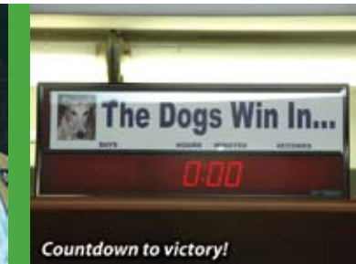
Countdown to victory!