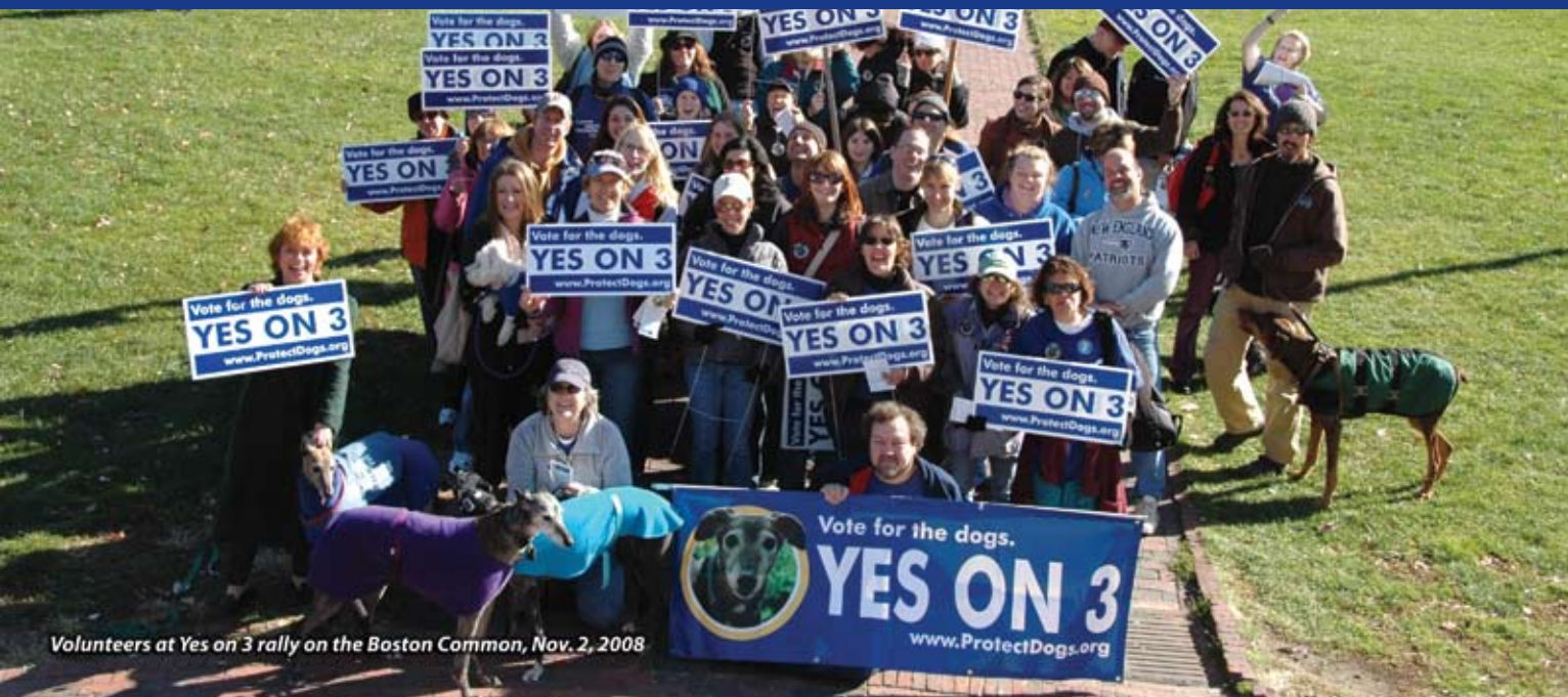
Volunteers at Yes on 3 rally on the Boston Common, Nov. 2, 2008