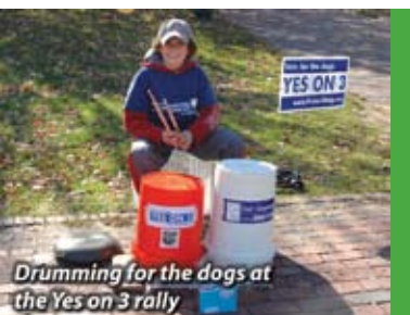
Drumming for the dogs at the Yes on 3 rally