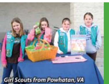
Girl Scouts from Powhatan, VA