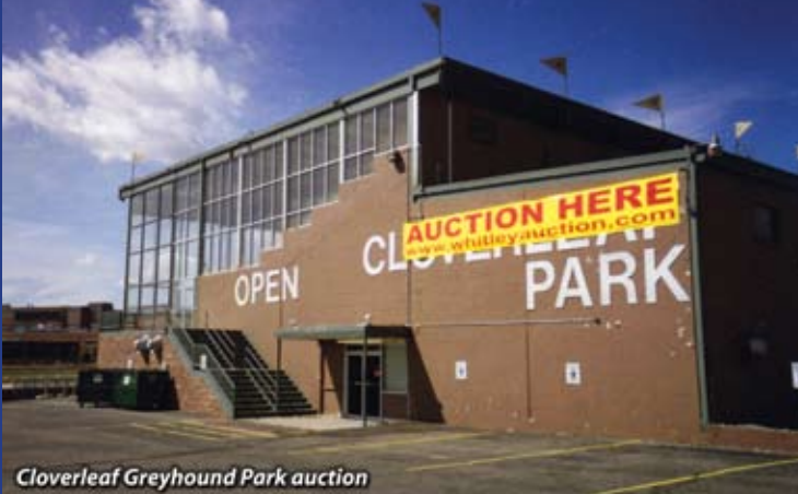
Cloverleaf Greyhound Park auction