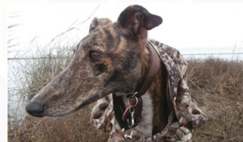
Lena of California