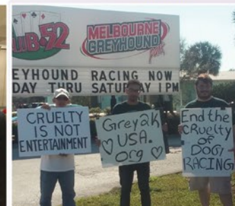
Space Coast Animal Rights protests at Melbourne dog track