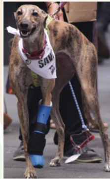
Millie of Australia