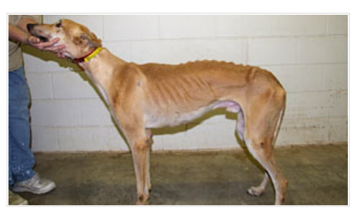
Florida maintains its wholesome image...by killing greyhounds.

Either way, it's fascinating to watch emerging bipartisan agreement that dogs shouldn't be tortured with performance-enhancing drugs, while also possibly extending the larger cruelty of mandating racing for a generation-spanning, 20 additional years. It's conceivable that Florida lawmakers could agree that dogs shouldn't endure doping, while mandating industrialized cruelty through prolonged dog racing.