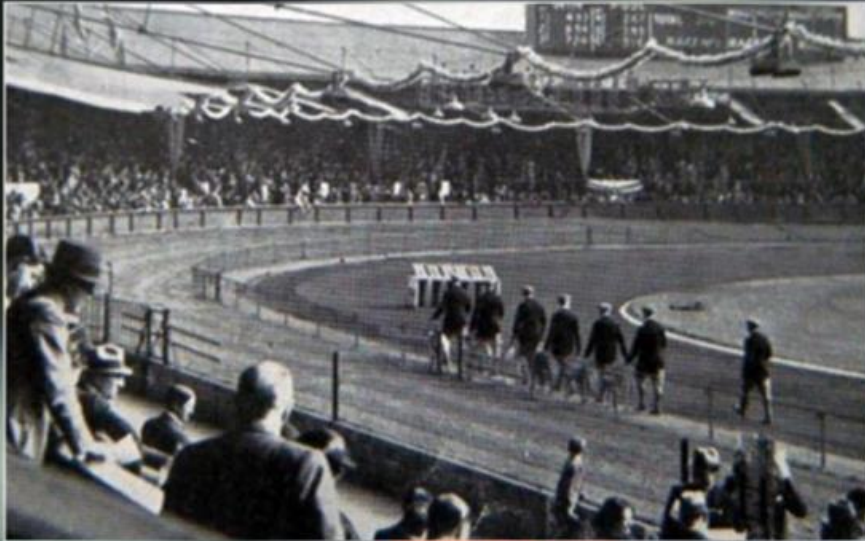
Wimbledon Stadium opening night Saturday 19th May 1928 - estimated 22,000 spectators

GOODBYE FROM US ALL AT WIMBLEDON STADIUM. THANK YOU TO EVERYONE THAT HAS VISITED THE STADIUM IS NOW CLOSED.