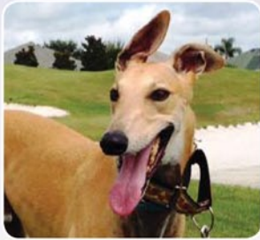
Zipper of Florida