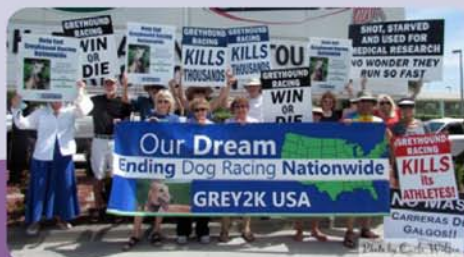
Supporters rally for the greyhounds, Florida