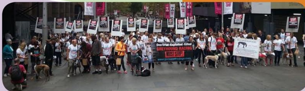
Gone are the Dogs Rally in Sydney, AU