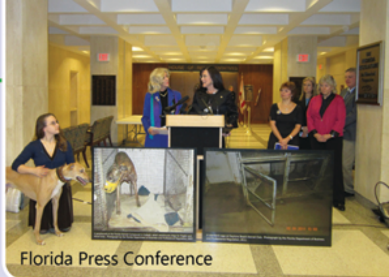
Florida Press Conference