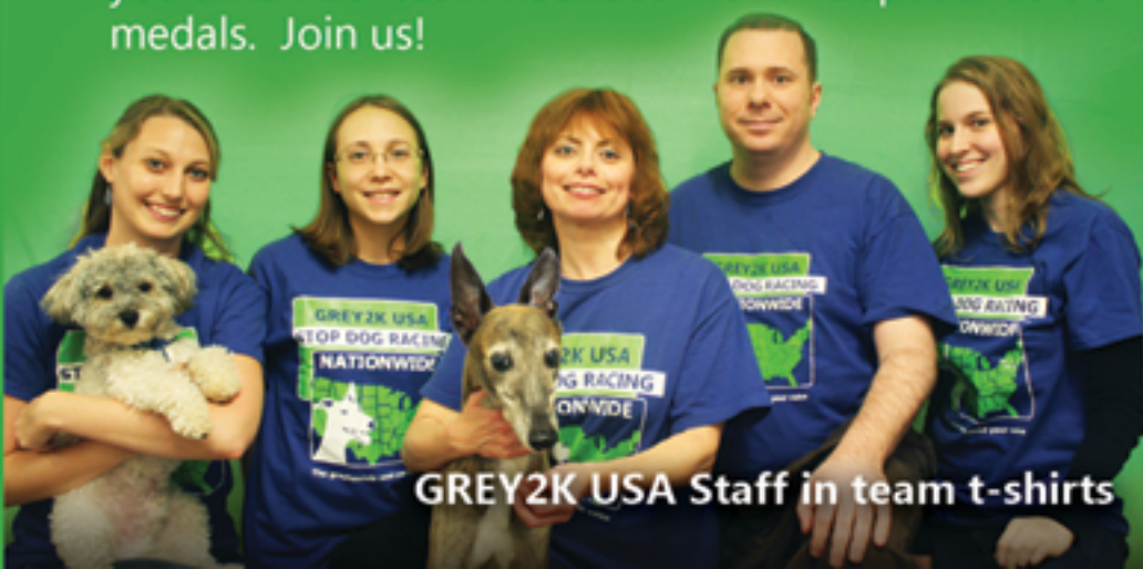
GREY2K USA Staff in team t-shirts

Together, we can help greyhounds worldwide to receive the second chance they so much deserve. Make a $50 donation or greater, and we will send you an official team necklace with two special edition medals. Join us!