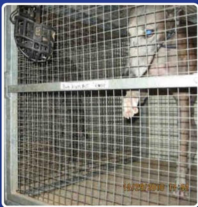
Photo of a caged dog at Tucson Greyhound Park

Greyhound puppies are separated from their mothers at a young age and painfully tattooed with racing numbers in their ears. They are kept confined in small, stacked cages and fed a diet based on raw diseased meat. When allowed out of their cages to run, many suffer serious injuries and die.