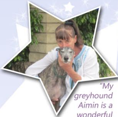
"My greyhound Aimin is a wonderful ambassador."