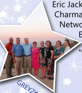
GREY2K USA Board