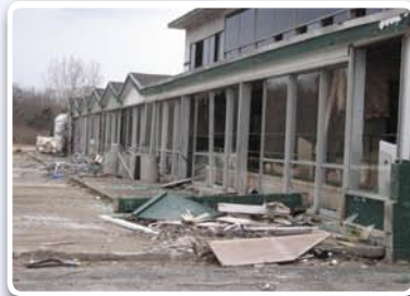
Photo of Hinsdale Greyhound Park, now closed.

When GREY2K USA formed in 2001, there were forty-eight dog tracks in fifteen states. Since that time, twenty-six tracks have closed for live racing all over the country, cutting a cruel industry in half. →