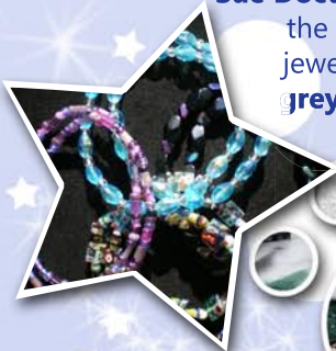
Zoe in her bling.