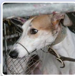
"Help save Macau greyhounds like me at RescueBrooklyn.org ."